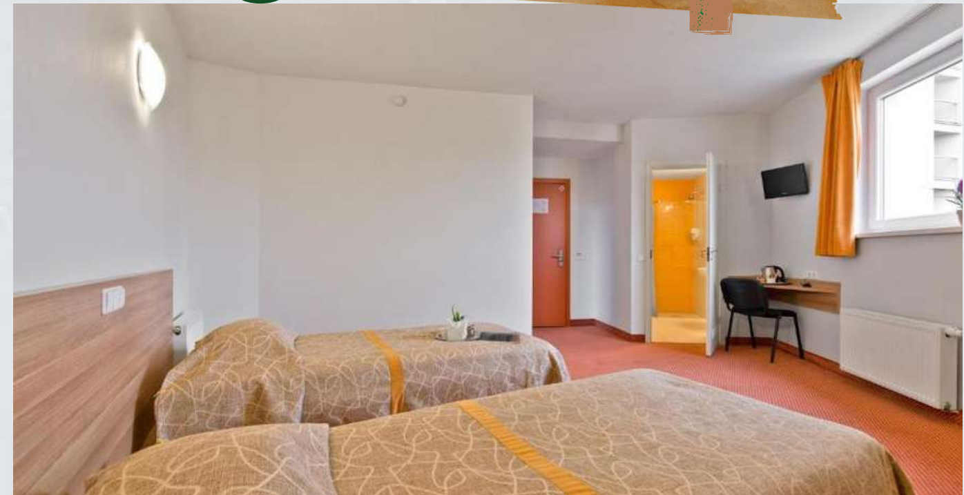
Pilaitės pr. 20, Vilnius 04352

From Vilnius train and bus station there are several busses: 1, 7, 54 and 2G, that stop at "Sietyno st". From Vilnius airport there are also several options like: