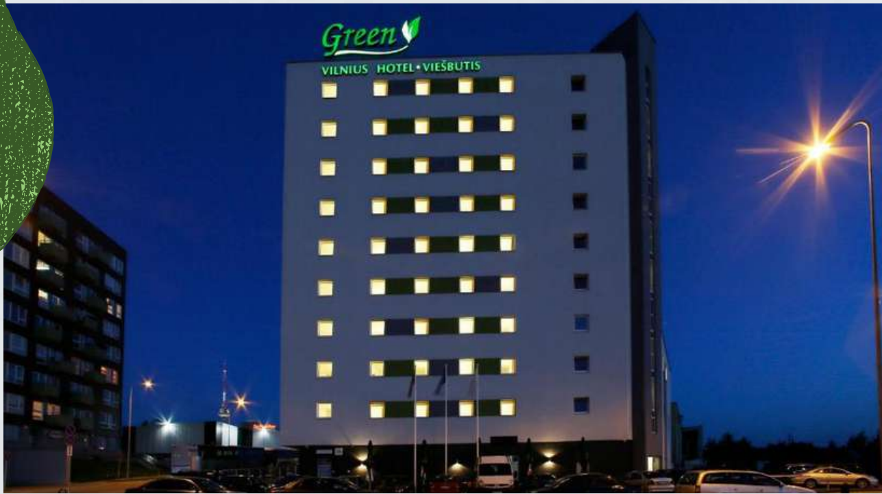
Green Vilnius Hotel